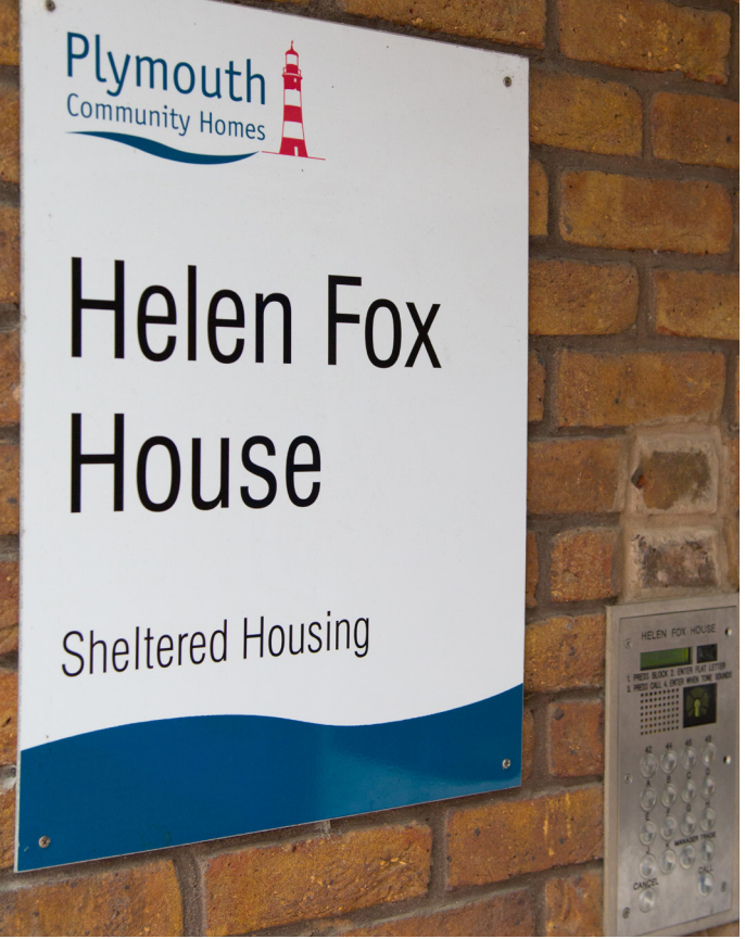
* Please note that all images are for illustrative purposes only.