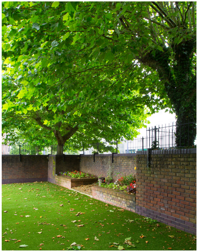
* Please note that all images are for illustrative purposes only.