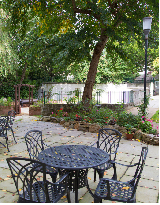
* Please note that all images are for illustrative purposes only.