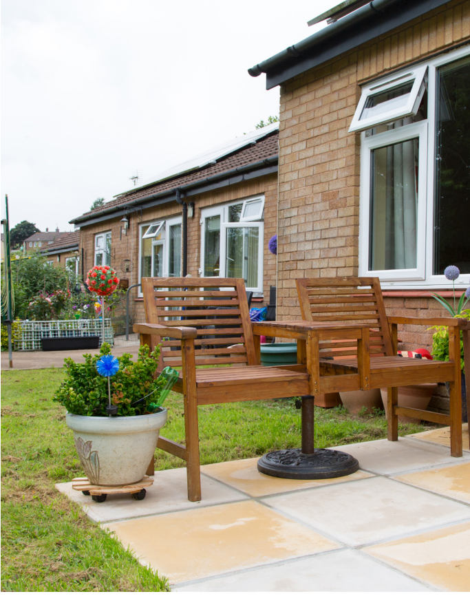
* Please note that all images are for illustrative purposes only.